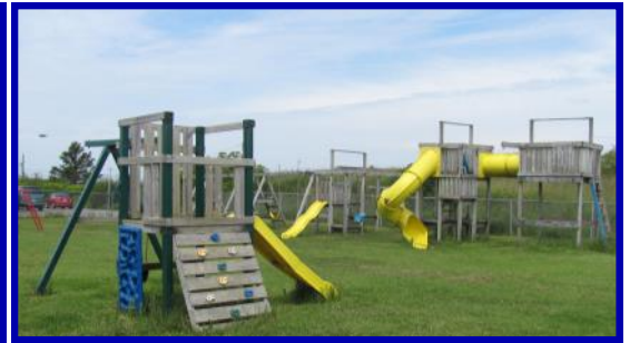
Clubhouse Playground (Woods Harbour)