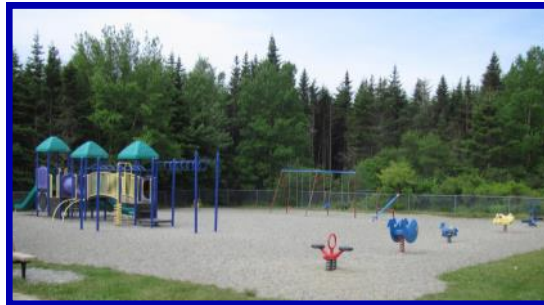
Sherosse Island Playground