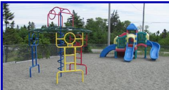
South Side Ball Field Playground