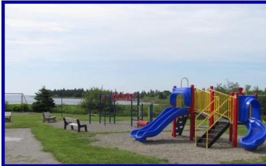
Brass Hill Playground

There are seven playgrounds in our municipality.