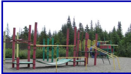
Wayne Perry Memorial Park (Bear Point)