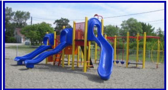
Barrington Ball Field Playground