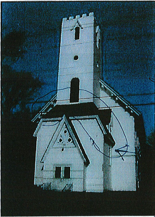
2288 Highway 3 Barrington Head, Nova Scotia

A large, white ecclesiastical building located on the western side of Highway 3, Barrington Head, Nova Scotia, the Wesley United Church is a somewhat imposing building in the small community. The front elevation with a large central tower faces Barrington Bay. The Municipality of the District of Barrington registered the church and cemetery on August 27, 1986.