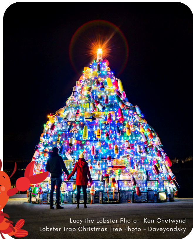
Lucy the Lobster Lobster Trap Christmas Tree