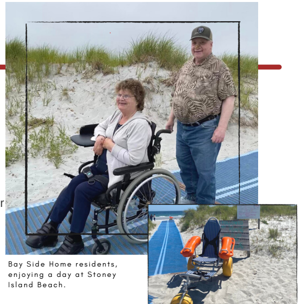
Bay Side Home residents, enjoying a day at Stoney Island Beach.

The Municipality of Barrington recognizes the support of the Province of Nova Scotia. We are pleased to work in partnership with the Department of Communities, Culture and Heritage to develop and promote our cultural resources for all Nova Scotians.