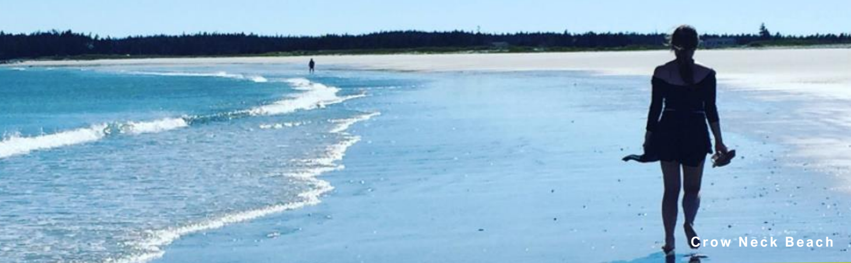
Crow Neck Beach