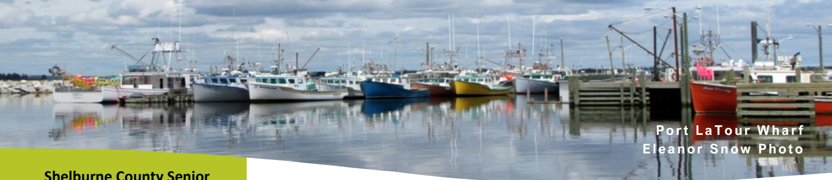
Port LaTour Wharf