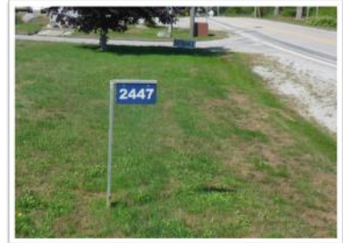
Property with the proper Civic Number

IT'S THE LAW – POST YOUR REFLECTIVE CIVIC NUMBER TODAY.