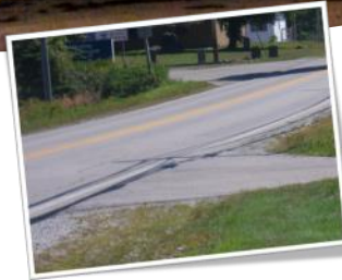
How can we find you?

Please assist us in keeping our public sewer systems working properly. Do not flush items such as diapers (child/adult), rags, mop heads, shop towels, etc. These items cause damage to the pumping system which result in expensive repairs and maintenance. Please contact our Director of Property Services at 637-2015 with any inquiries or problems regarding the sewer system.